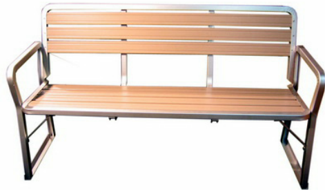
5' Bench, Aluminum, Boxed $399.00

Premium quality. 62" L x 34" H x 19" D. A perfect complement to any dock system. Designed to comfortably seat 3 adults. Earth Sand, Cloud White or Sea Green Seat & Back Color. Fasten without any holes being drilled with supplied hardware kit. Can be easily removed or relocated. Suggested use is with 5' or 6' wide dock sections. It can also be mounted to shore.