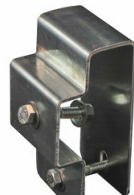
Horizontal Bumper Bracket Side Mount

Aluminum brackets mount on side or end of dock to attach 2" x 4" bumper board. Two brackets required for every 10' of bumper length, and, 3 for every 15' L bumper. Supplied with mounting hardware.