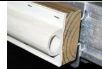
Style 2 White PVC Vinyl (ea.) $26.00

Style 2 - 3½" High x 1¼" Deep. 10' Lengths. Fully covers side of 2"x4" or 4"x4" wood bumper.