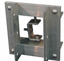
Vertical Bumper Bracket

Aluminum brackets mount on side of dock and attach a 3.5"x3.5" or 4"x4" upright post. Perfect for pontoon and larger boats. Supplied with Mounting Hardware. The Light Weight Floating Dock model includes a deck brace to enhance the strength of the bumper.