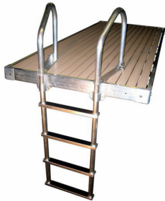
Swim & Dock Ladder, Boxed $212.00

Premium quality. 60" H with 4 steps 12" apart. High strength aluminum pipe formed into a pleasing curved design. A 2"W x 16"L 3M® Safety-Walk Tread Strip is applied to the steps to ensure good footing. Ladder can be easily installed on either a Metal Craft ® Dock, or on a wood pier. It can be easily relocated with supplied hardware kit.