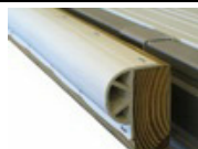
Style 1 White PVC Vinyl (ea.) $26.00

Style 1 - 3" High x 1¼" Deep. 10' Lengths. Covers most of the top and side of 2" x 4".